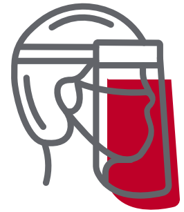
FACE SHIELD WORN WITH OTHER ACCEPTABLE MASK

*Note: we will have additional face masks available onsite for any attendee that requires one