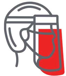
FACE SHIELD WORN WITH OTHER ACCEPTABLE MASK

*Note: we will have additional face masks available onsite for any attendee that requires one